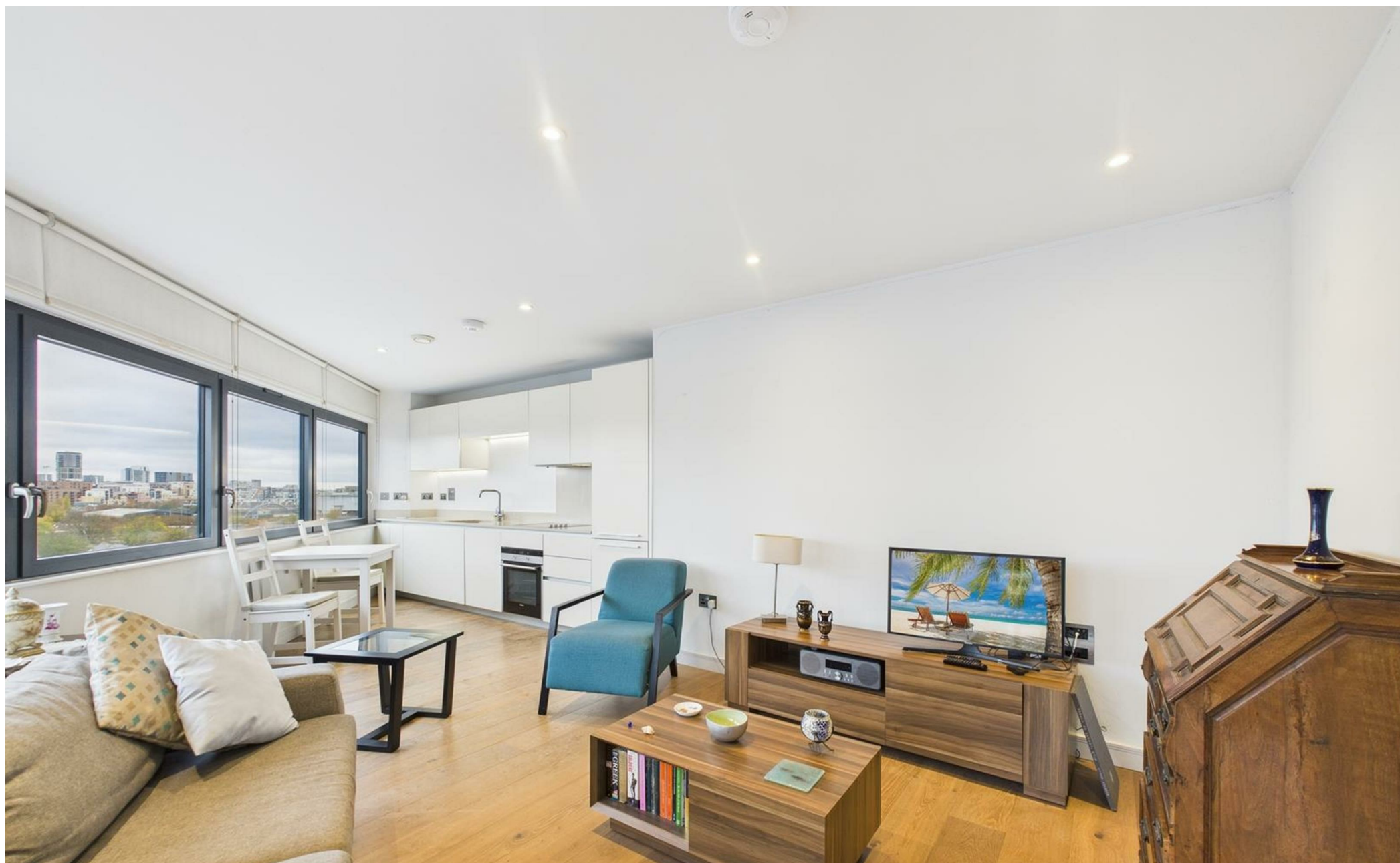
31 8 Lambarde Square, Greenwich, London, SE10 9GB £375,000